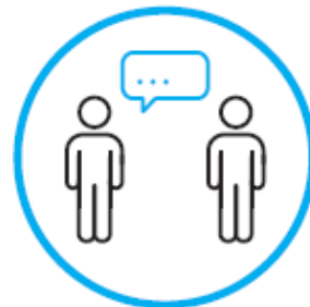
Wellbeing of staff and customers