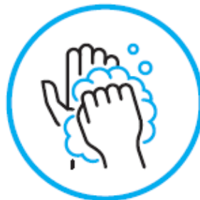
Hygiene and cleaning